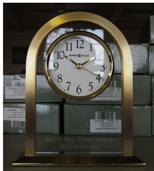
Clock - September Award