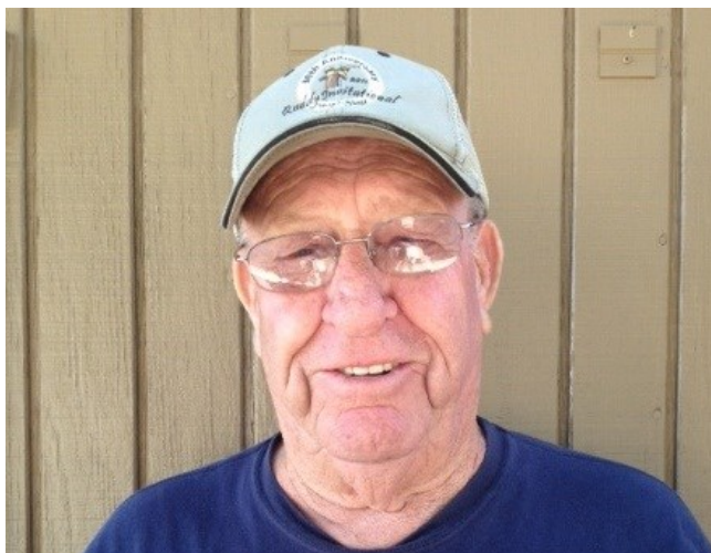
Willey Wood "B Doubles"