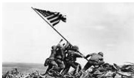
Iwo Jima—70 Year Anniversary