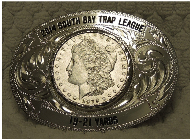
Year-End Belt Buckle