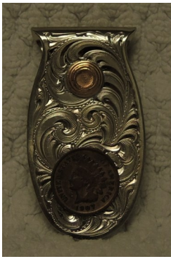
All-Star Money Clip