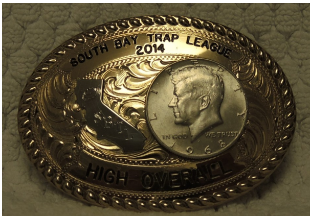
Participant Belt Buckle