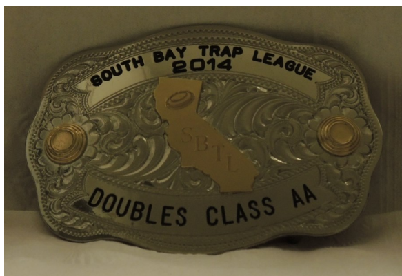
August Awards Sunnyvale Shoot Belt Buckles