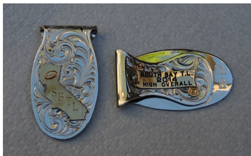
The winners were awarded this Money Clip at the Livermore shoot.