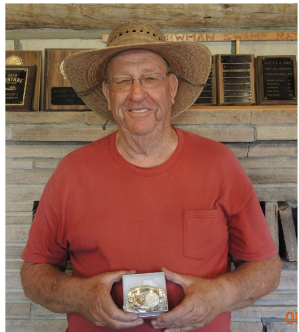
Willey Wood "B Doubles"